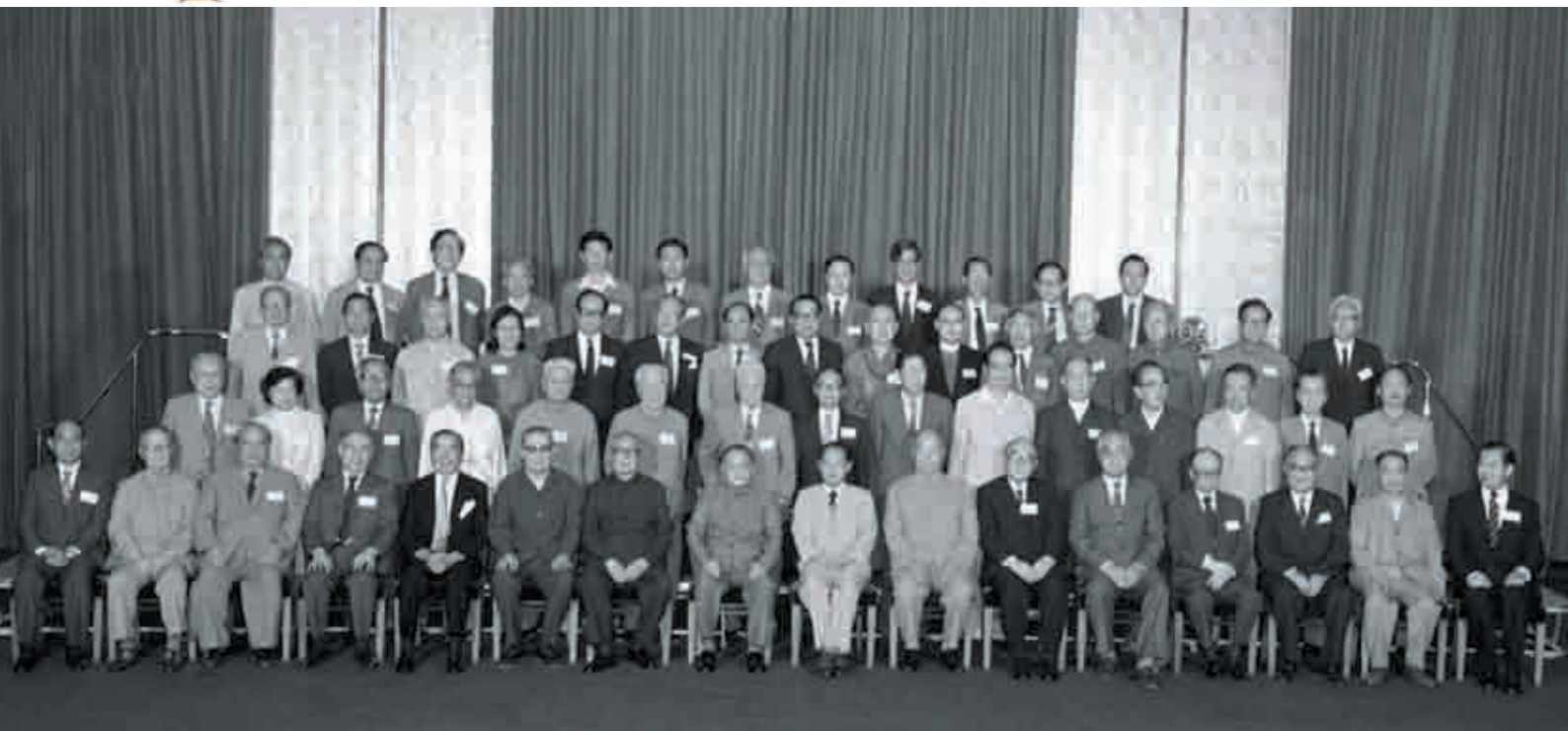
National leaders Deng Xiaoping, Li Xiannian, Peng Zhen and Hu Yaobang and Members of the Drafting Committee.