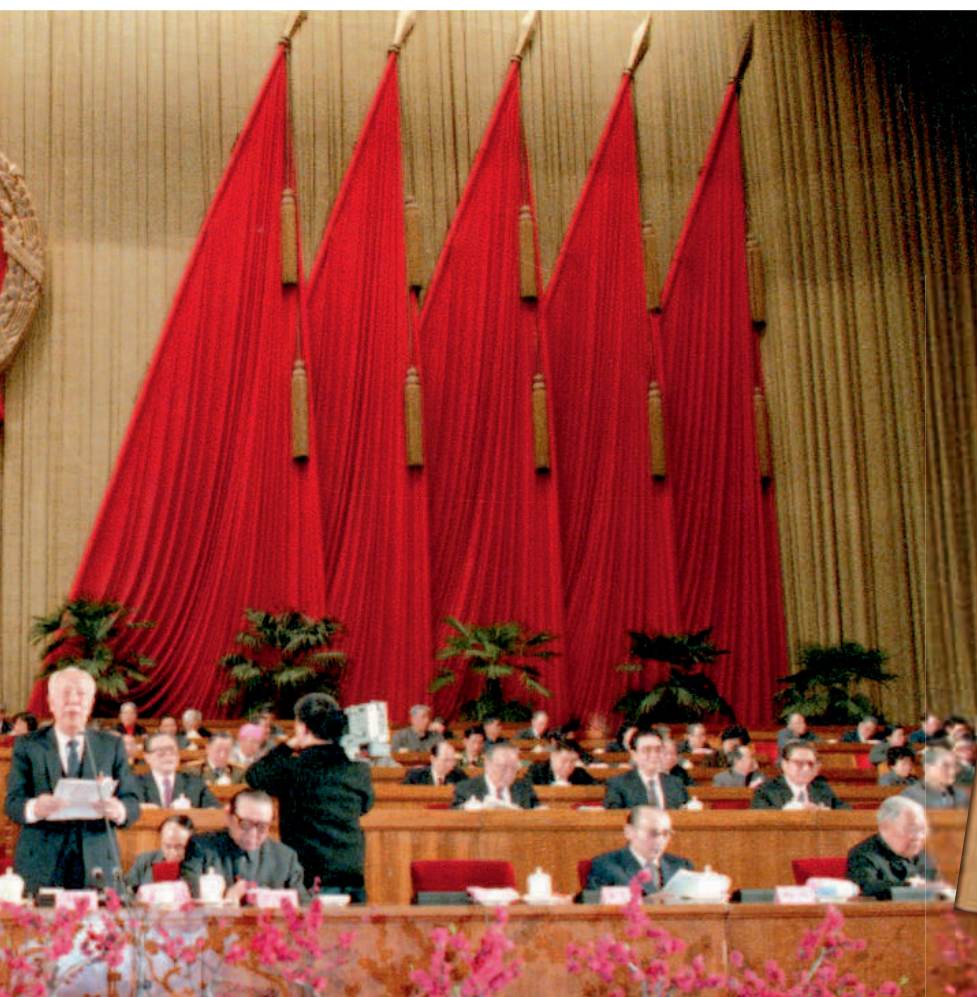
The Basic Law of the Hong Kong Special Administrative Region of the People's Republic of China was adopted at the Third Session of the Seventh National People's Congress on 4 April 1990.

According to the basic principles stipulated in the Sino-British Joint Declaration and in light of the actual situation in Hong Kong, the Basic Law was enacted in accordance with Article 31 of the Constitution, prescribing the establishment of the HKSAR directly under the CPG and the basic contents of the "One Country, Two Systems" principle to be practised in the